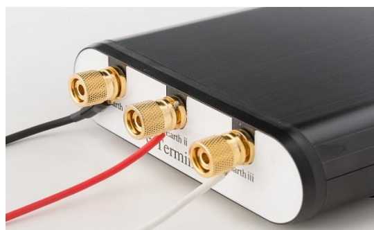
Three Earth Terminals