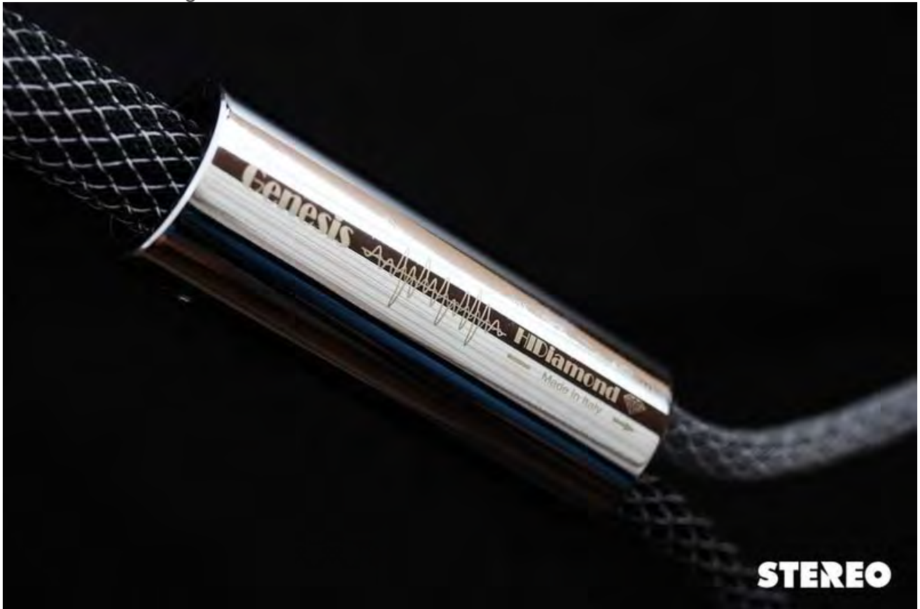
Cáp loa GENESIS HiDiamond Small

The two pairs of speaker cables we experience in the STEREO listening hall belong to the GENESIS series: the top of the table is called BIG, the second one is called SMALL. On the sensory side, both yarns are large and heavy with a thick outer lining but still flexible. The GENESIS speaker line adopts HiDiamond 4VRC999% AG © advanced processing technology. The strings use XLPE insulating material, 100 times better than traditional materials such as Teflon. They help the strings improve the control sound, eliminating excess flows in the heights of the sound reproduction frequencies. This makes the sound consistent, harmonious with high linearity, greater musicality, quiet sound, with more material and lasting sound