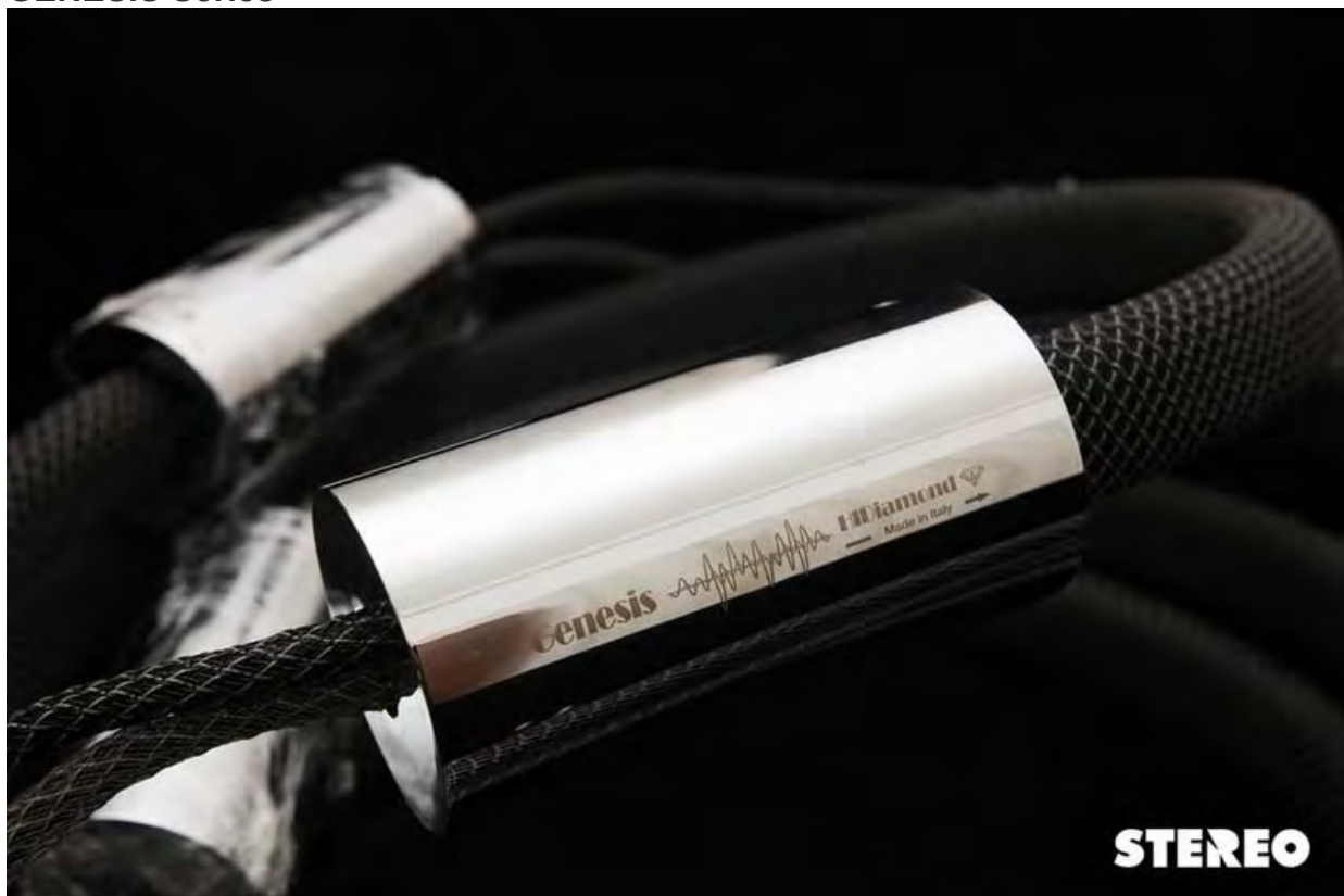
Cáp loa HiDiamond GENESIS Big